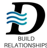
Table Talk - Wednesday, November 8th at 6:00 p.m. in the Family Life Center. Menu: BBQ Sandwiches, slaw, baked beans and corn, as well as PB&J for the kids and kids at heart! Cost: $4 per person/$15 MAX per family/ Children under 4 - FREE. Bring a friend with you!

This is the final week of our series called "Sticks and Stones Are Not the Problem." The concept comes from the children's rhyme, "Sticks and stones may break my bones but words will never hurt me." This rhyme is a blatant lie. Words are often the most painful weapons we can use against each other. How many of us are carrying deep and hurtful wounds caused by someone's malicious words uttered years ago. This series is a reminder that our behavior matters and through Christ we are called to pay close attention to what comes out of our mouths as a leading indicator of what is in our hearts.